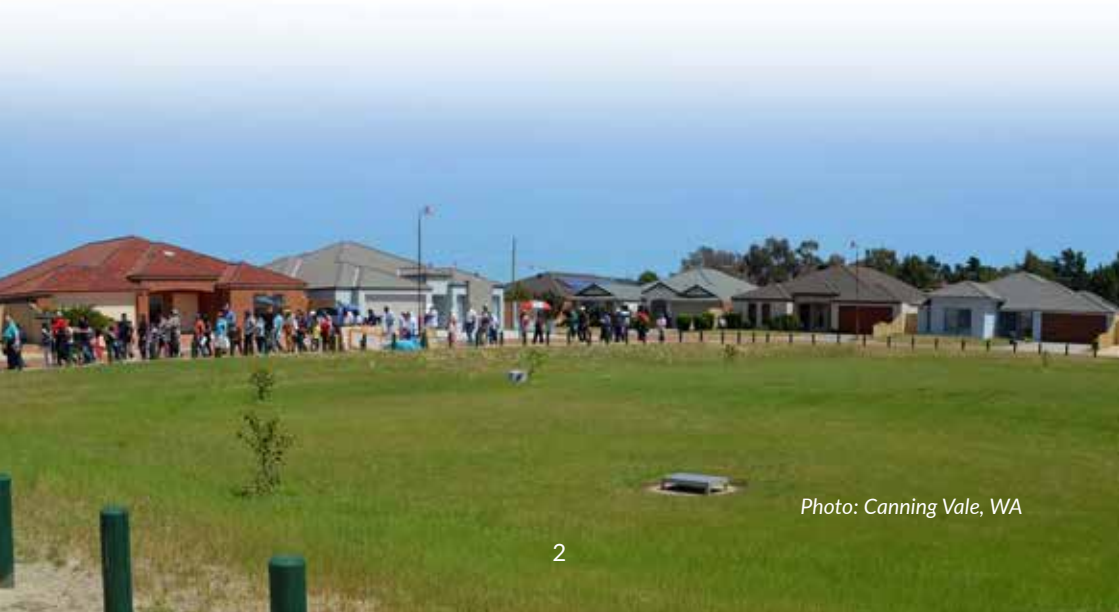
Photo: Canning Vale, WA

“Somebody who says his Rosary alone only gains the merit of one Rosary, but if he says it together with thirty other people, he gains the merit of thirty Rosaries. This is the law of public prayer. How profitable, how advantageous this is!” - Saint Louis de Montfort