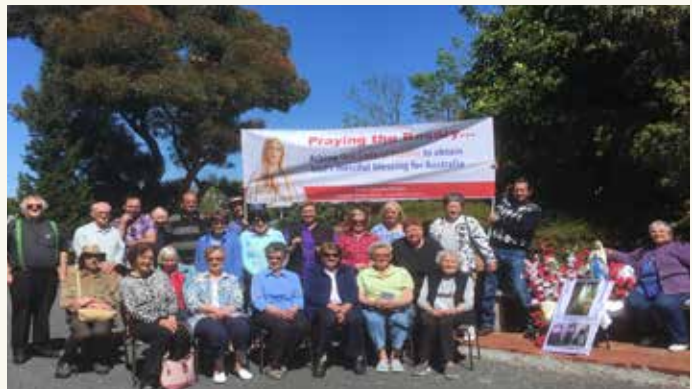
Photo (from top to bottom): Clyde North, VIC Cleveland, QLD Kerang, VIC Seymour, VIC.

Make sure that the velcro is a very strong type, self-adhesive - industrial is recommended. Industrial velcro or heavy duty can be purchased at any hardware store. Strong velcro ensures that the wind will not pull the banner away from the poles.